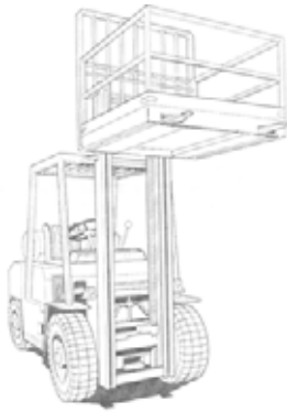
Figure 1 – Counterbalance truck with non-integrated working platform

4. Examples of forklift trucks fitted with platforms are given below:-